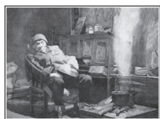
"The Light from the Heaven" Zhou Tianya, China

A COLLECTION OF WORKS FROM THE NWS 2009 EXHIBITION, FEATURING WORKS FROM THE NATION'S MOST HIGHLY RESPECTED ARTISTS.